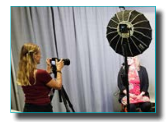
Headshot Booth — $7,500 (1 available)

The headshot booth is a highly valued and popular service in the exhibit hall. Attendees can update their photos or let students take their first professional shots! The booth will operate Thursday through Saturday during exhibit hall hours.